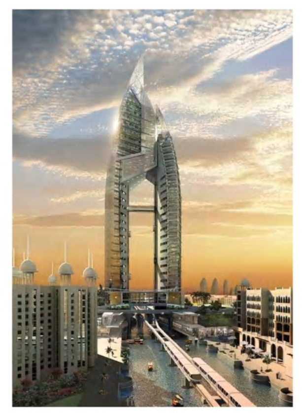
The Trump International Hotel & Tower, which will be the centerpiece of one of the palm islands, The Palm Jumeirah.