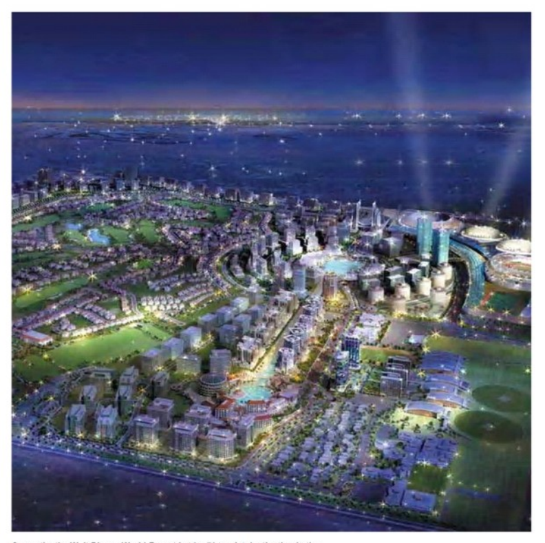
Currently, the Walt Disney World Resort is t he #1 tourist destination in the world. Once fully completed, Dubailand will easily take over that title since it is expected to attract 200,000 visitors daily.